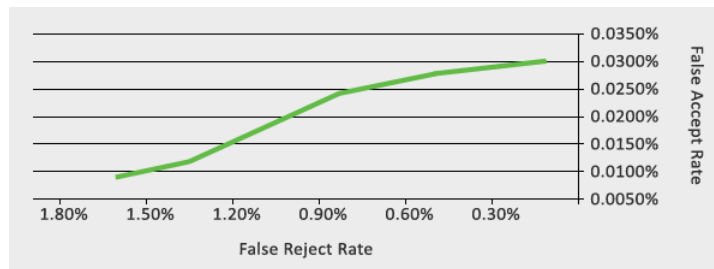
Figure A: The 1:N recognition ratio

The graph indicates the ratio between the percentages of false reject (no-detection) to false accept (false detection) rates. The percentages of false accept are three cases out of 10,000 (3/10,000) when the false reject is at two cases out of 1,000 (2/1,000). When higher security is set and the percentages of false accept are one case out of 10,000 (1/10,000), the false reject rate will provide 15 cases out of 1,000 (15/1,000).